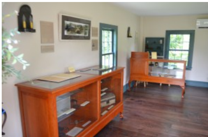
Figure 2: Interior of the Deed House

Reserve your room by August 1, 2017 - Mention SFA