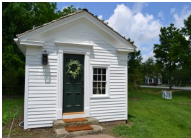
Figure 1: The Newly Restored Ebenezer Sheldon Deed House

Reserve your room by August 1, 2017 - Mention SFA